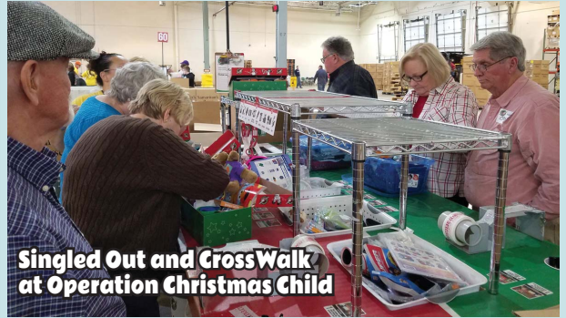
Singled Out and CrossWalk at Operation Christmas Child