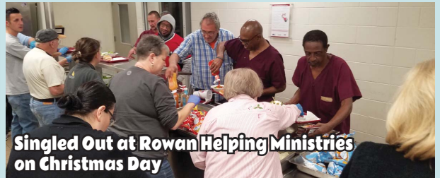
Singled Out at Rowan Helping Ministries on Christmas Day